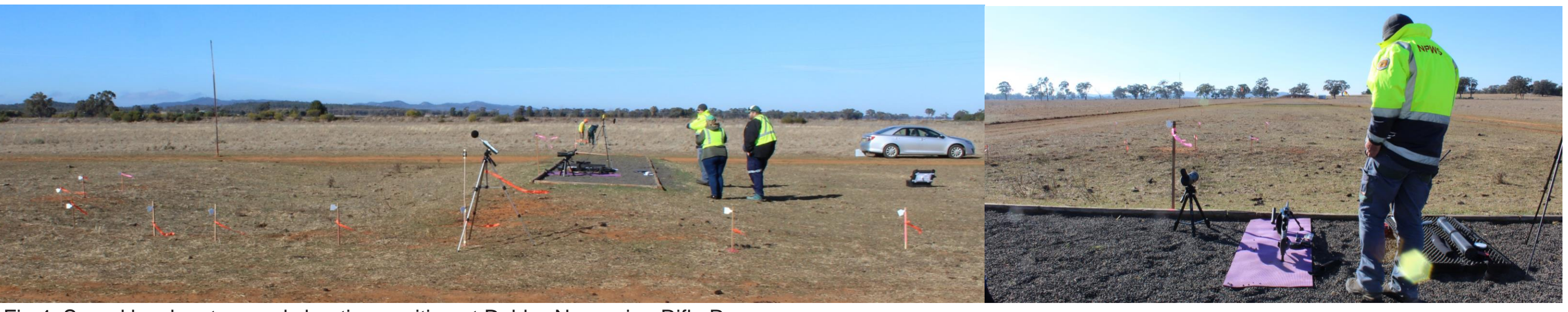
Fig 4. Sound level meters and shooting position at Dubbo-Narromine Rifle Range.